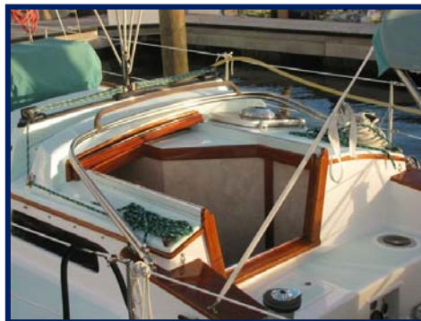
Open Companionway Hatch