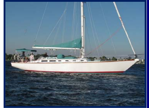
Starboard Side View