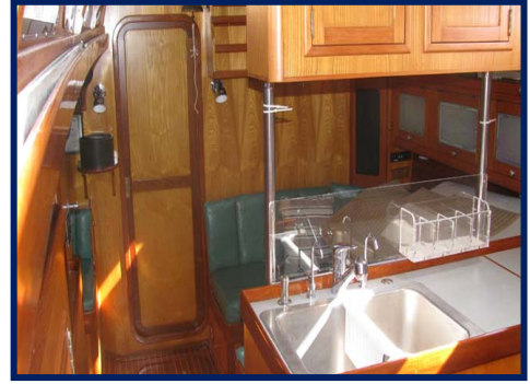
Dinette and Galley